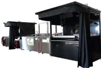
Pre cleaning & Post cleaning system