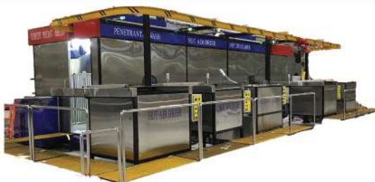
FPI Booth System Electrostatic Spray Type