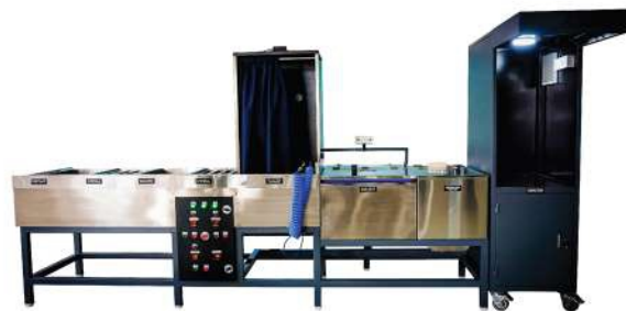
FPI Dip Tank System